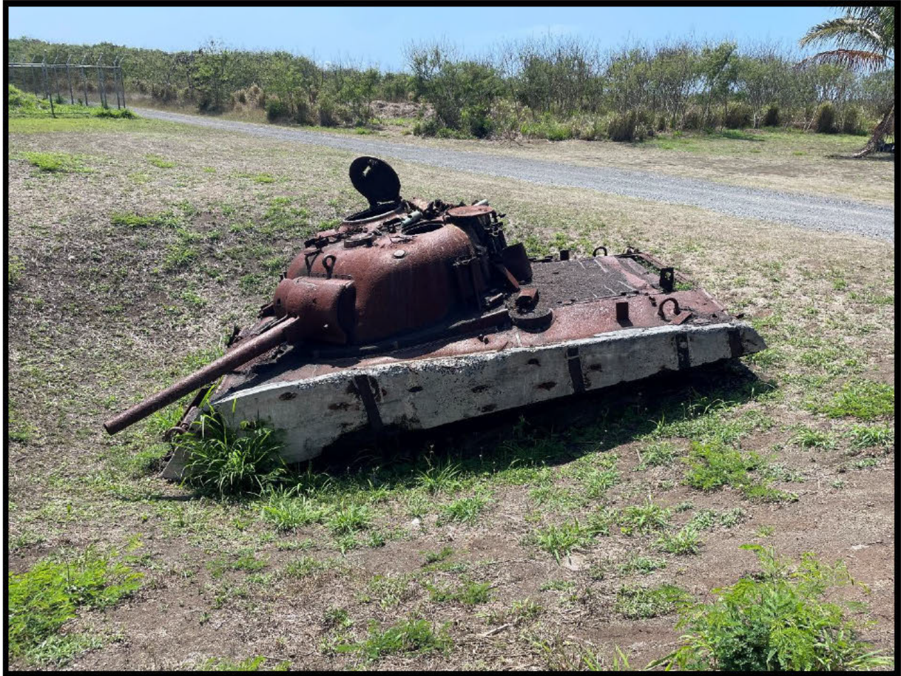
Figure 2. The American Sherman tank near which [REDACTED] said the identification tag was found.

DPAA historians believe the tank is an American Sherman medium tank, specifically a late model of the M4A3 with a 75-millimeter gun. 2 The tank sits across a gravel road from a Japanese war memorial and is a stopping point for tourists. Specifically, the tank is located at the center of Iwo Jima, south of the main airport runway at 54RWN3117640284 MGRS (24°46'36.98"N, 141°18'30.23"E) (Figures 3 and 4).