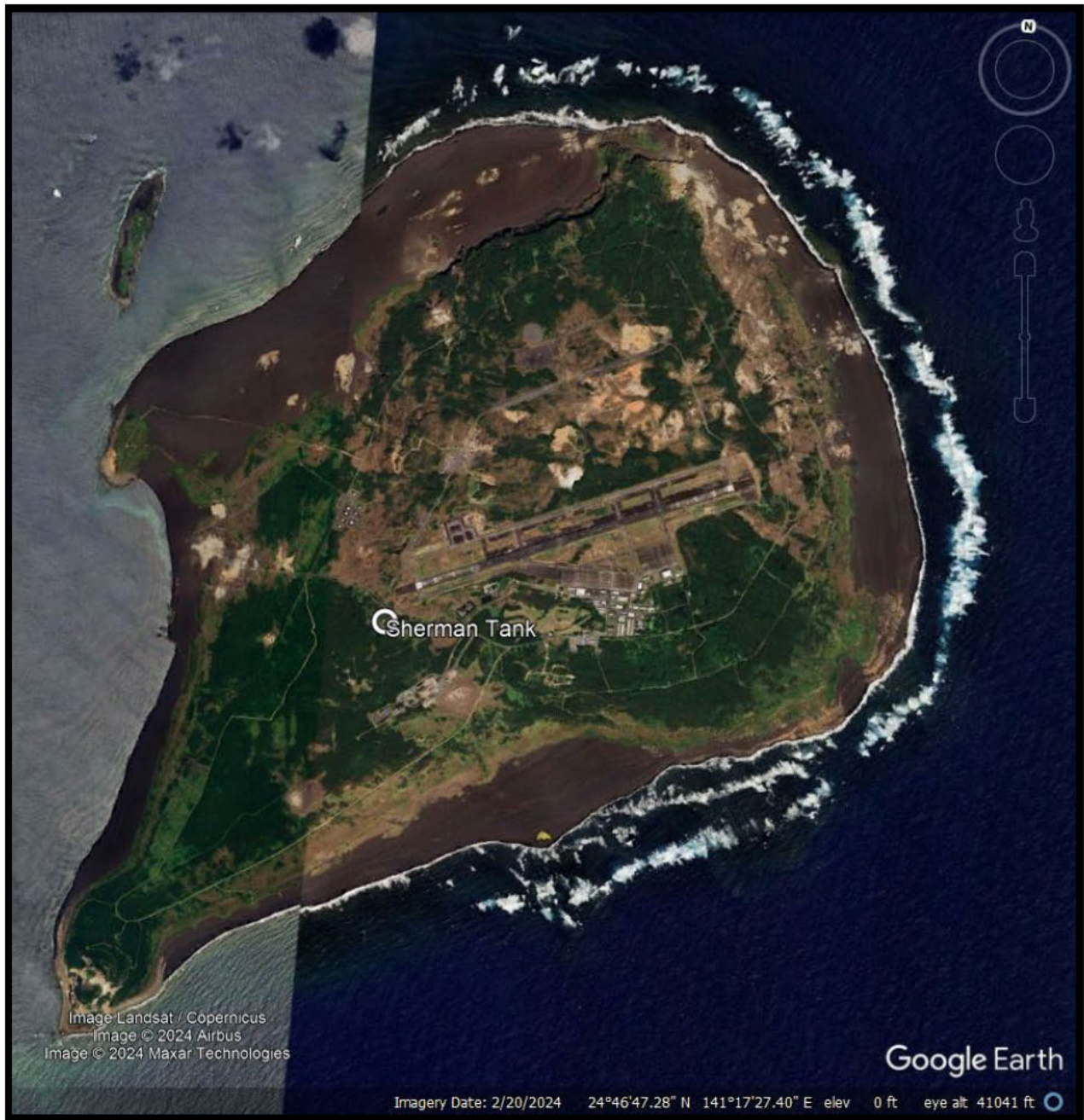
Figure 3. The Island of Iwo Jima with the location of the Sherman tank marked at center.