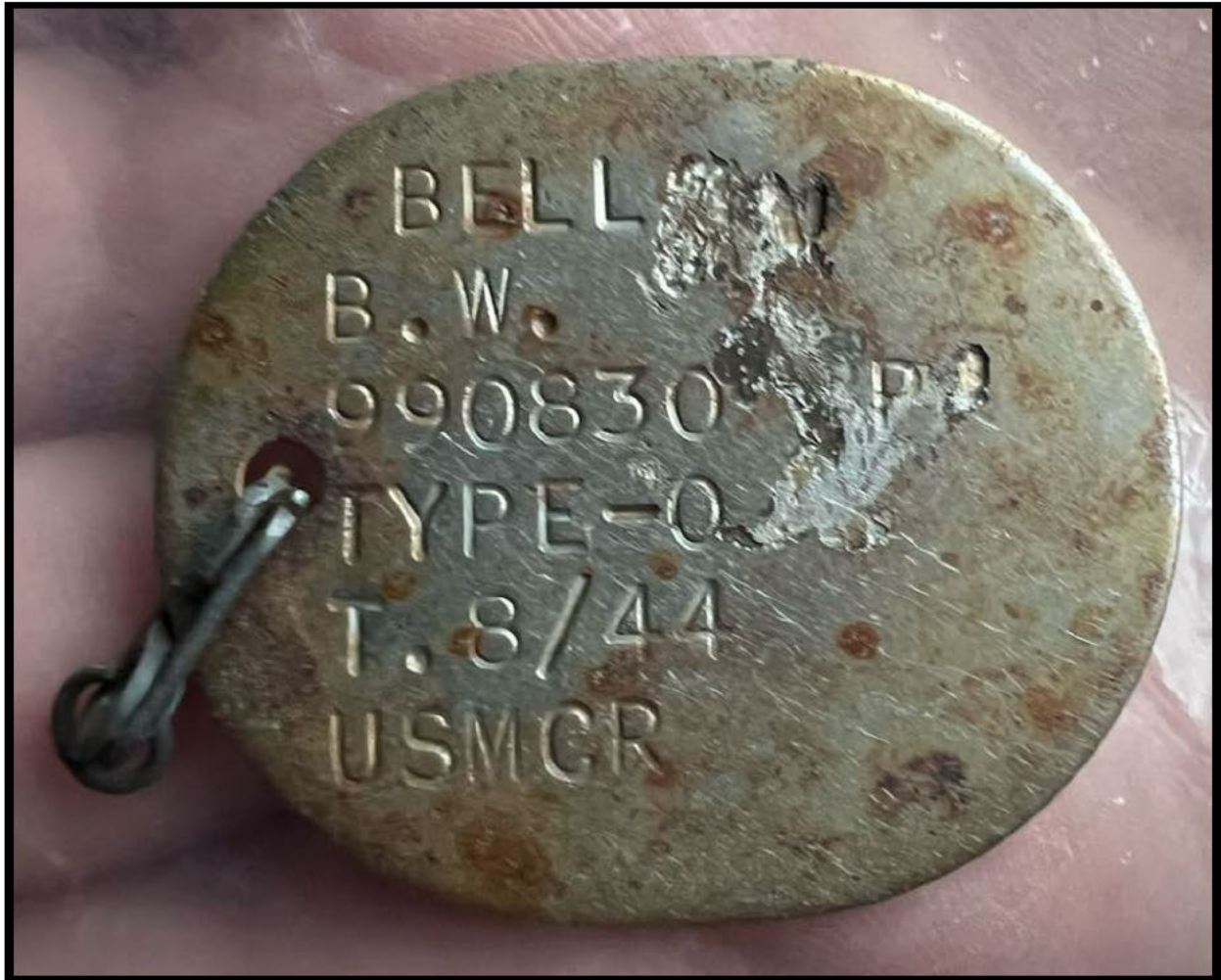
Figure 1. The American identification tag found by Japan Self Defense Force personnel near an American Sherman tank site at Iwo Jima.